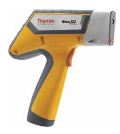
Niton XL2: With point-and-shoot simplicity, you can view the alloy grade and chemistry on the built-in, color, touch-screen display.

The Niton XL2 stands far above the competition, with its many standard features and available options. By utilizing the standard Thermo Scientific Niton Data Transfer (NDT®) PC software suite to customize the instrument, you can set operator permissions, generate custom reports, print certificates of analysis personalized with your own company logo, or remotely monitor and operate the instrument hands-free from your PC. Integrated USB and Bluetooth® communications provide direct data transfer to your PC or networked storage device, eliminating the cumbersome data synchronization procedures required by Windows Mobile®-based XRF analyzers.